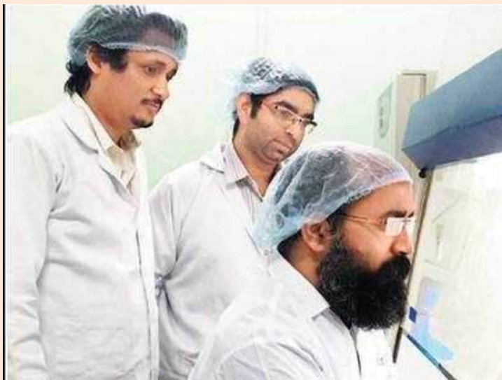
The researchers from Department of Chemical Engineering at work

https://mumbaimirror.indiatimes.com/mumbai/other/iit-b-students-developmethod-to-advance-stemcell-growth-in-laboratory/articleshow/67100303.cms